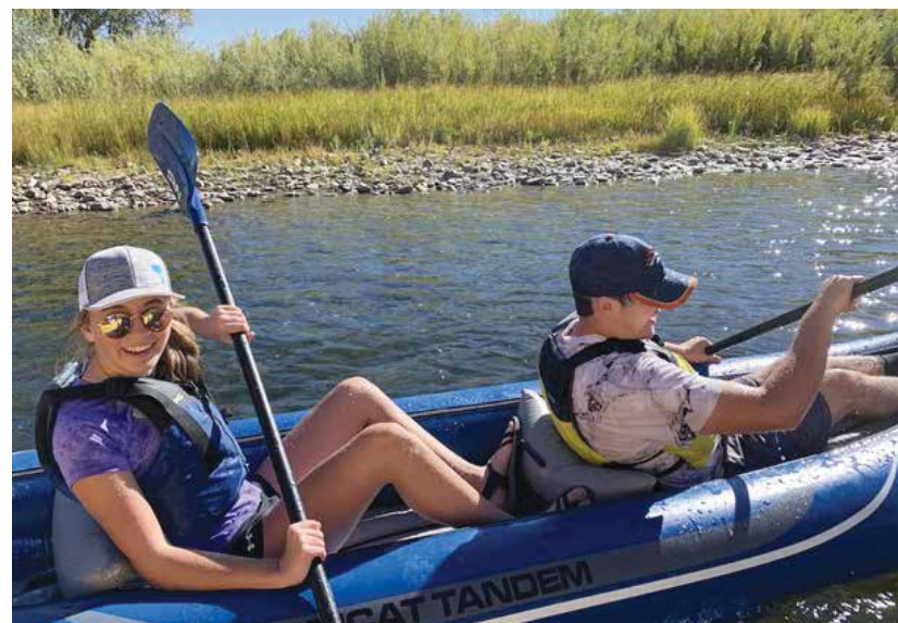
The Buddy Program - Rifle High School Outdoor Leadership