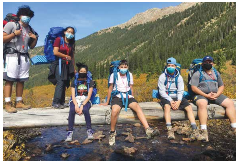
Nature Connection – Delta County 9th Graders on the River