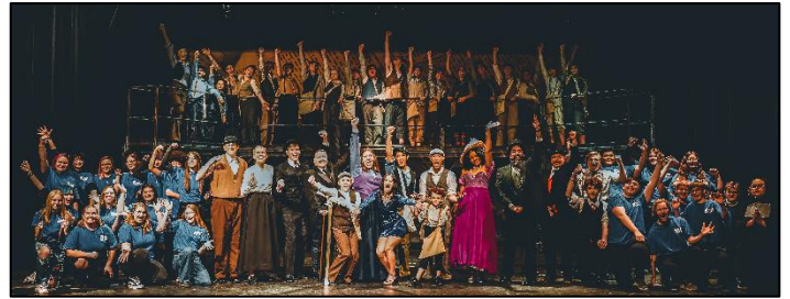
CHS theatre students at their production of Newsies