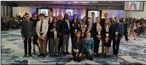
CHS FBLA students at the State Leadership Conference