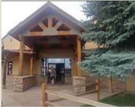
The former Jeans Westerner Building in downtown Montrose is being renovated into a multi-service Youth Access Center.

Please join us as we charge onward to $100 million!