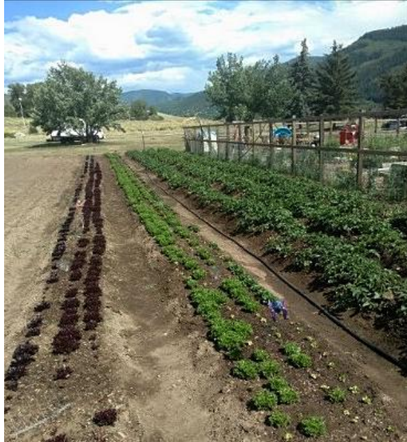
An expanded irrigation system will allow Vail Valley Salvation Army to grow more fresh vegetables for their clients.

Mike notes that Food Bank of the Rockies has a good supply of food. "What we really need is a cadre of reliable volunteers who can be available to oversee the food distribution at