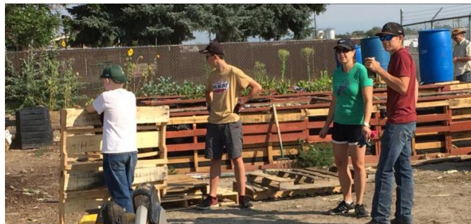
Sharing Ministries volunteers building a community garden and fruit orchard.

Community food and hunger relief is the theme for our competitive grants this year. We are pleased to announce 18 organizations received grant funding to expand work they are doing to alleviate hunger for our most vulnerable citizens in communities across western Colorado.