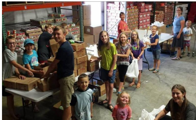
Families pack bags of food to be distributed along the Lunch Lizard food truck routes. 11,700 bags of weekend food were distributed the summer of 2018, up from 4,500 bags the previous summer.

The organization that galvanized the weekend emergency food backpack program is expanding to include teacher snacks. Starting this fall, Kids Aid will be piloting its new hunger relief program. Called the SnackPack program , Kids Aid will leverage its bulk purchasing power to secure granola bars, raisins and other snacks at a very good price and use its existing food distribution program to deliver snacks to five