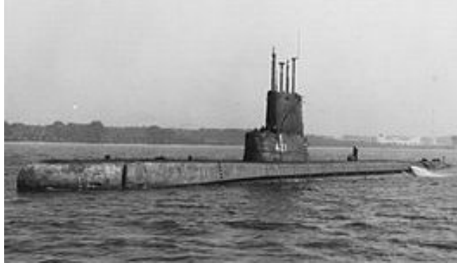
The USS Trutta (SS 421)

We recently made a grant to Delta County Memorial Hospital (DCMH) to purchase equipment to provide Respiratory Therapy and Treatment to newborns and pediatric patients. Many of these patients require a specialized respiratory therapy called Continuous Positive Airway Pressure (CPAP) to help newborns adapt to breathing outside of the womb. DCMH did not have the equipment and had to either manually administer the therapy or send the tiny infants to facilities in Denver or