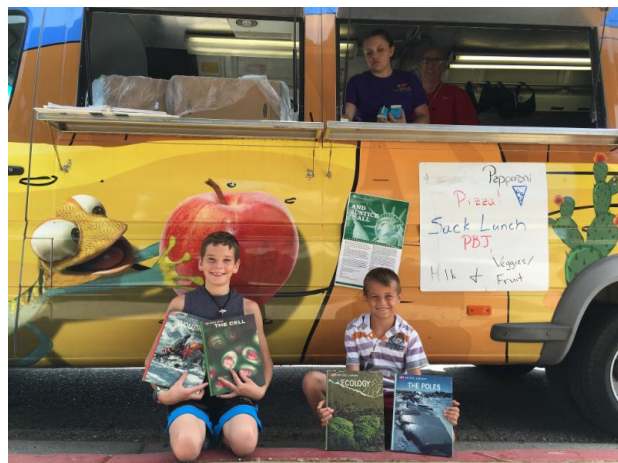
Kids get a free lunch and books at Lunch Lizard summer meal stops along two routes in Clifton and Orchard Mesa.

Daily enrichment activities add fun and learning during lunch stops