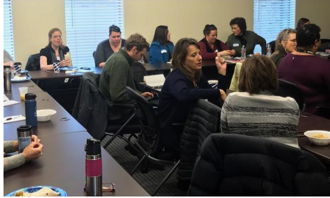
Staff from organizations including Hilltop, Center for Children, Grand Junction Police Department and others gathered for the kick-off of Resilience 2018.

Throughout our community, countless professionals deal with trauma every day - in law enforcement, social work, counseling, first response, health/medicine, education and many other fields. While these dedicated people navigate vicarious trauma and fatigue, they often suffer in silence, which leads to burnout and resignation. Our community needs to support these professionals so they can continue their vital work.