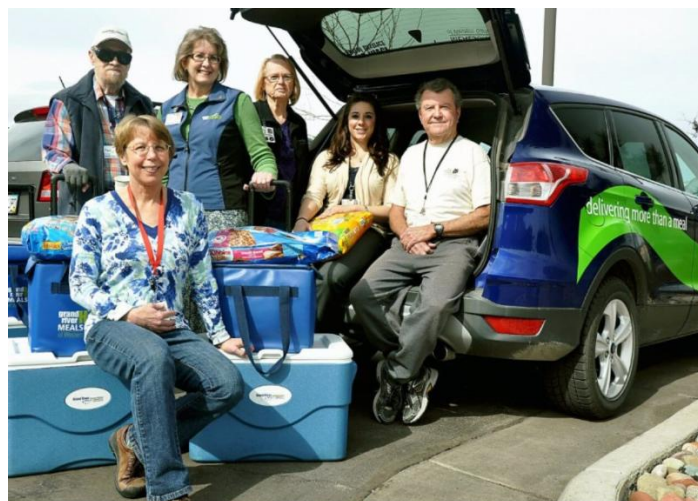
Volunteers for Meals on Wheels deliver bags of pet food once a month to clients with furry companions.

If you are over 70 1/2, you may want to consider using