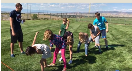
Children in the Partners program play games with their adult mentors.

Go to wc-cf.org for a complete list of current grantees.