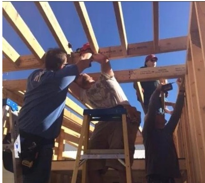
CASA volunteers and youth work on the pilot tiny house in Montrose.