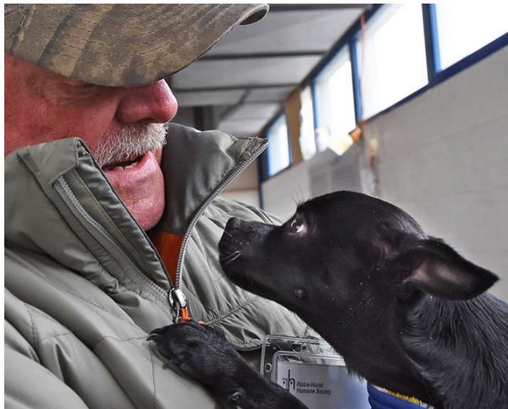
A Roice-Hurst volunteer cuddles up to Gargoyle at its Mesa County animal shelter