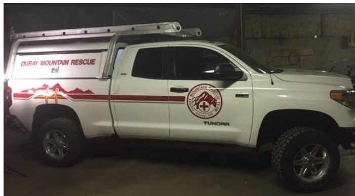
Ouray County grants distributed in 2015 included funding for Ouray Mountain Rescue Team to help purchase a new rescue vehicle.